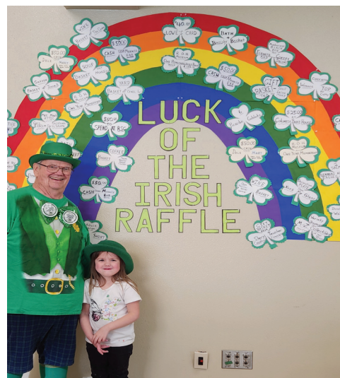
51 prizes Ruffled off for the Luck of the Irish raffle with young and old participating!

They will be in the Library for your reading pleasure on a "Grab and Go" basis. Please pass them on to others to enjoy when you have finished with them.